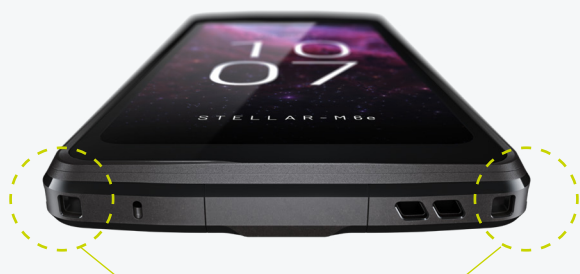
2 slots for a neck strap