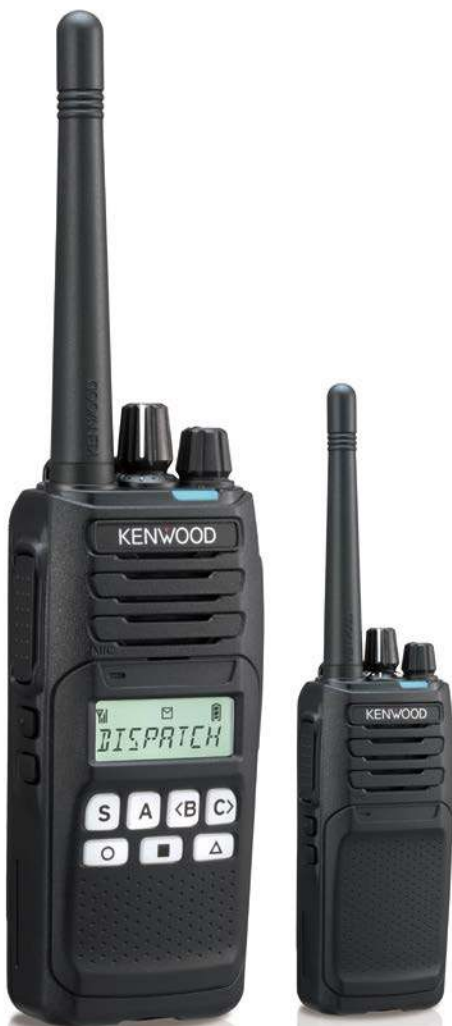
Standard Keypad model