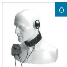
CXR16/DX* Bone conductive throat mic, submersible PTT