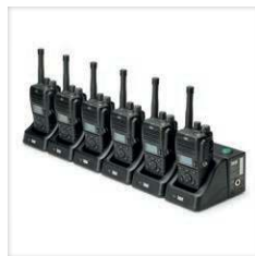
CSBHX Six-way charger

Supplied package includes: Li-Ion battery pack, rapid charger, belt clip, high-efficiency antenna and quick-start user guide.