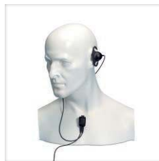
EA12/DX Earpiece microphone