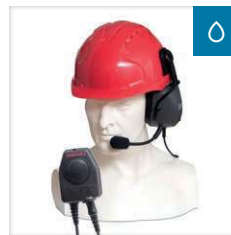
CHP450HS/DX* Hard hat ear defender submersible PTT