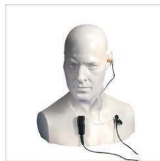
EA15/DX Covert earpiece microphone