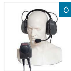
CHP450D/DX* Headband ear defender submersible PTT