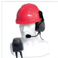
CHP750HS ■ CHP950HS ▲ Hard hat eardefender, submersible PTT