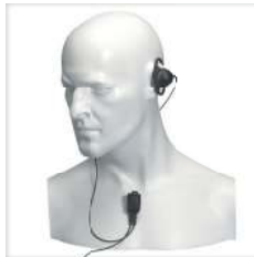
EA12/750 ■ EA12/950 ▲ Earpiece microphone