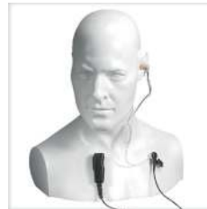
EA15/750 ■ EA15/950 ▲ Covert earpiece / microphone