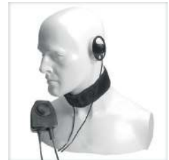
CXR16/750 ■ CXR16/950 ▲ Throat mic. Bone conductive