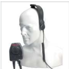
CXR5/750 ■ CXR5/950 ▲ Skull mic. Bone conductive