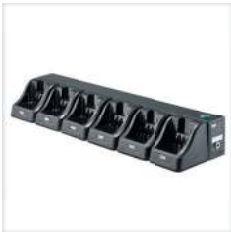
CSBHT ■ Six-way charger

HT649 GMDSS can be supplied in different package combinations, please consult your dealer.