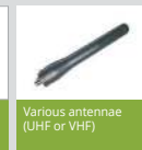
Various antennae (JHF or VHF)